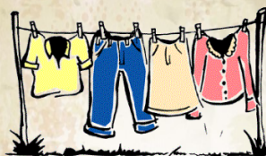
Children's Clothes Closet

It's getting warm outside and there are good clothes available in our WBC Children's Clothes Closet. These children's clothes are free and we always have new families that utilize this ministry. If you have any new or gently used children's clothes, shoes, new underwear, t-shirts, or socks; bring them to the clothes closet down stairs next to the nursery.